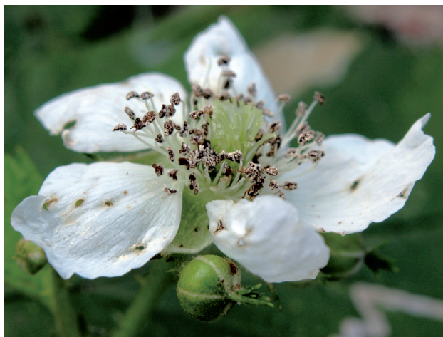
FIG. 3. Flower of Rubus maximus