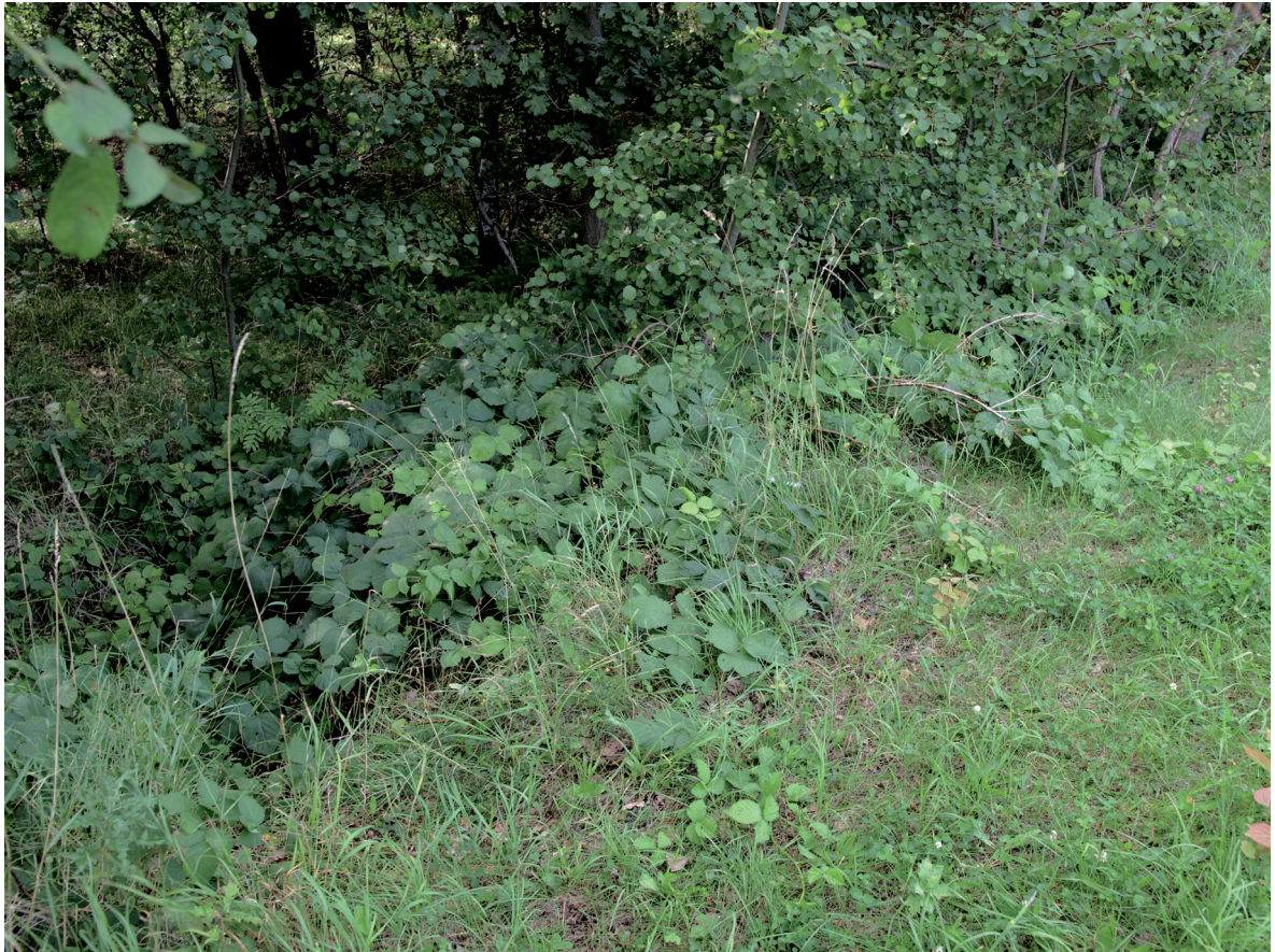
Fig. 7. Rubus maximus in wayside thickets