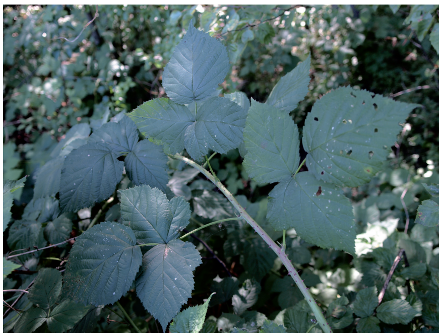
FIG. 6. First-year non-fruiting vegetative shoot (primocane) of Rubus maximus