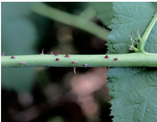
FIG. 5. Rubus maximus – fragment of vegetative stem against a background of the upper side of the leaf