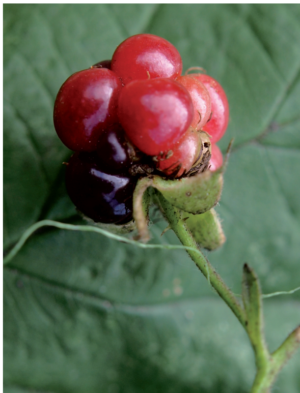
FIG. 4. Aggregate fruit of Rubus maximus (Phot. P. Kosiński)