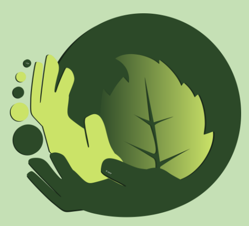
ISPP INTERNATIONAL SOCIETY FOR PLANT PATHOLOGY

The International Society of Plant Pathology changes its face! The new logo, which takes the place of the old one designed by APS for the 1973 International Congress, celebrates the values that have characterised the ISPP since its birth.