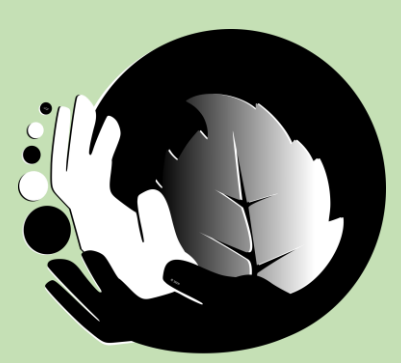
ISPP INTERNATIONAL SOCIETY FOR PLANT PATHOLOGY