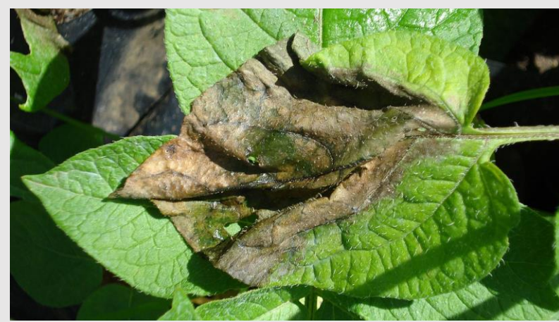
A plant in Chile affected by late-blight disease. NC State researchers track the evolution of strains of P. infestans , the pathogen that caused the Irish potato famine in the 1840s, which continues to harm plants worldwide.

The study, published in Scientific Reports , shows that the historic lineage called FAM-1 was found in nearly three-fourths of the samples (73%) and was found on all six continents. "FAM-1 was much more widespread than previously assumed, spreading from Europe to Asia