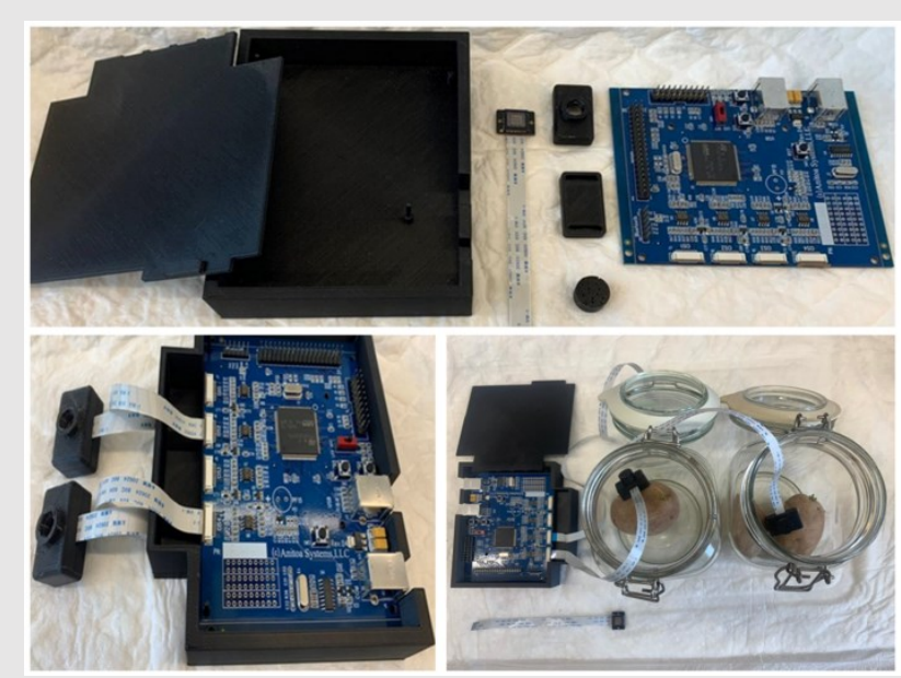
Biosensor System (Photo credit: Hebrew University).

Israeli farmers import European potatoes for planting in Israel. However, a certain percentage of them carry disease within that cause rot and significantly reduce the potato's quality. The