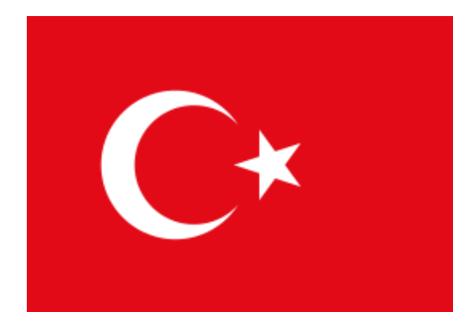
2023. Türkiye and Syria