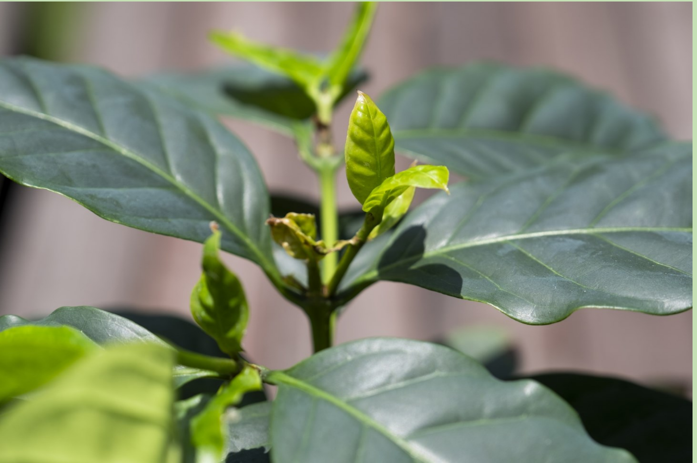
The Arabica coffee plant (Photo credit: NTU Singapore).

By comparing the high-quality genomic sequences of Arabica with those of Robusta and C. eugenoides , the research team found that the three species are still highly similar genetically. This suggests that for future breeding programmes to ensure that Arabica plants have disease resistance, breeders can consider using other related coffee species, such as Robusta and C. eugenoides .