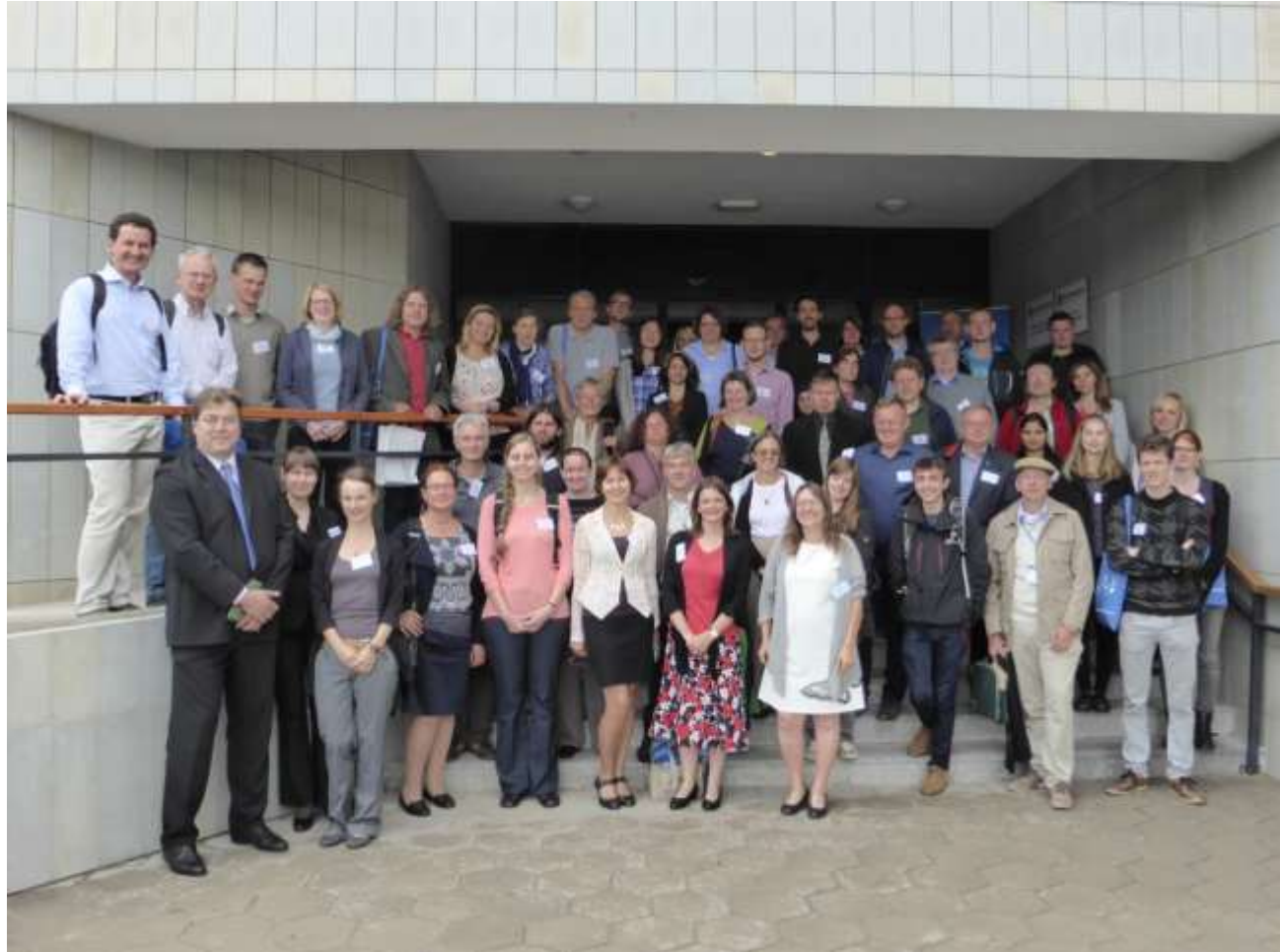
Meeting 2016, 07-09 September, Tartu, Estonia