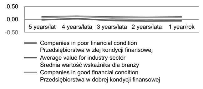
Fig. 4. Return on Current Assets Indicator in Selected Businesses