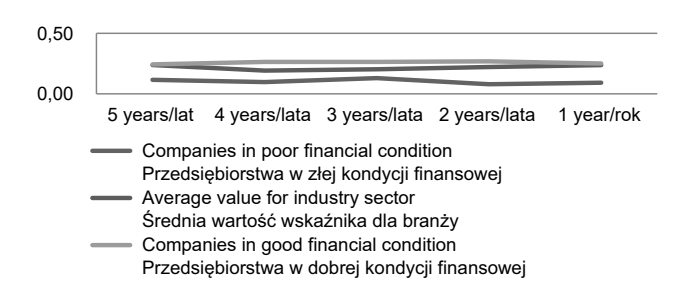
Fig. 2. 'Quick Ratio' Indicator in Selected Businesses

Rys. 2. Wskaźnik płynności natychmiastowej w badanych przedsiębiorstwach