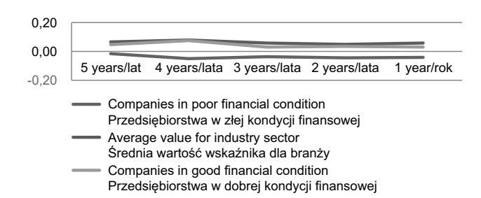
Fig. 3. Return on Total Assets in Selected Businesses

For the whole study period only the solvent companies displayed cost level indicator values below 1.0, and were relatively close to the average for this industry indicating that firms from this group were able to generate profits. Those companies which declared bankruptcy showed values above 1.0. Comparing total costs and