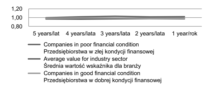
Fig. 5. Costs Indicator in Selected Businesses