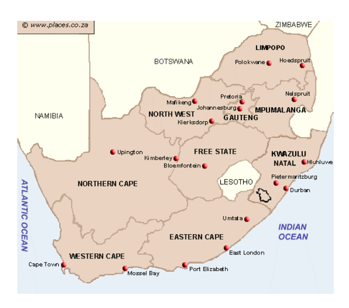
Fig. 1. Map of South Africa

Intsika Yethu Local Municipality is one of six local municipalities situated within the Chris Hani District Municipality (CHDM) in the Eastern Cape Province of South Africa. According to Mgxashe et al. (2000) the municipality was established pursuant to the 1998 Municipal Structures Act, and consists of two main towns, namely Cofimvaba and Tsomo. Intsika Yethu Local Municipality covers the greater part of the province, which until 1994 was known as the Transkei. It has a total area of about 3,041 km² (Mgxashe et al., 2000). The average minimum temperature ranges from 24°C in September to 29°C between December and February, and winter is said to be cold. The lowest temperatures are recorded