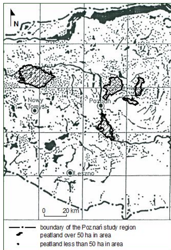
Fig. 2. Investigated landscape parks in the context of the peatlands map of the Poznań region

The location of landscape parks under investigation on a map of peatlands in the Poznań region [ILNICKI et al. 1996], covering a significant part of Wielkopolska and Lubusz regions, is shown in Figure 2. All the landscape parks under discussion are found